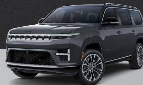
Baltic Gray Metallic