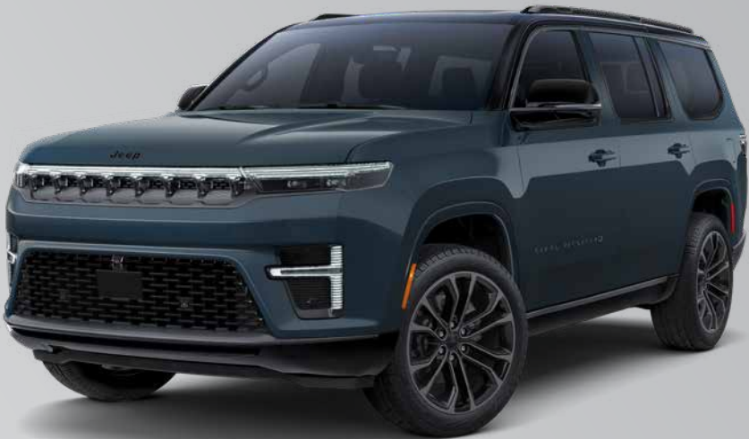
Summit Obsidian in Steel Blue