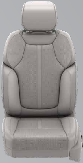
Ventilated Nappa Leather-Trimmed with Axis II Perforations and Sea Salt / Basil Accent Stitching — Sea Salt / Global Black (Standard)