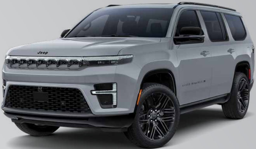
Limited Reserve with Black Appearance Package in Ghost