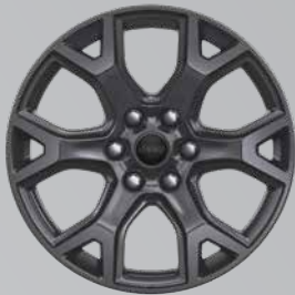
20-inch Aluminum Painted Luster Gray Metallic (Standard)