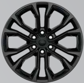
22-inch Aluminum Painted Black Noise with Gloss Black Inserts (Standard)