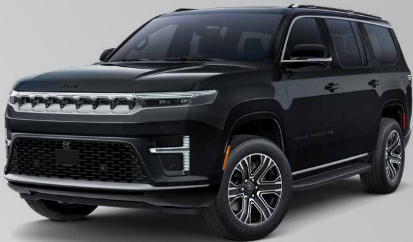
Limited in High-Gloss Black