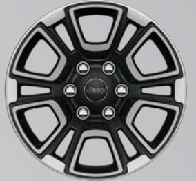
18-inch Machined-Face Aluminum with Black Noise Pockets (Late Availability)