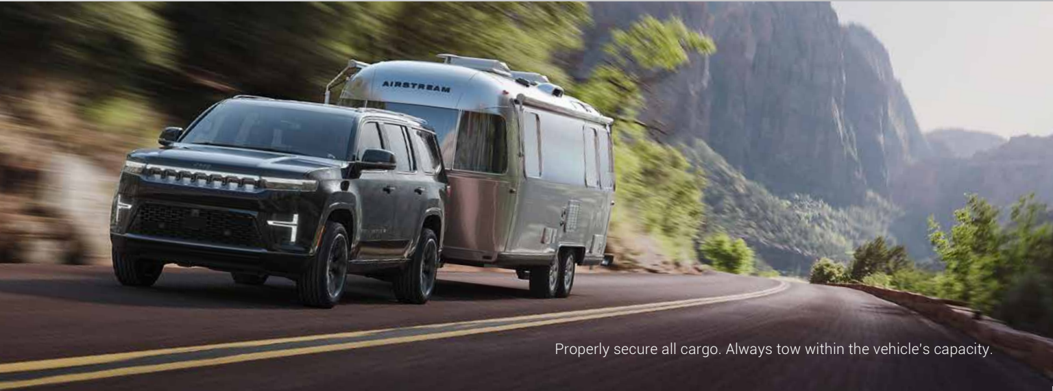
Properly secure all cargo. Always tow within the vehicle's capacity.