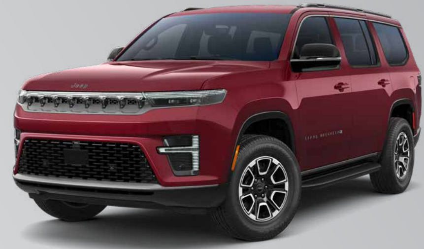
Grand Wagoneer in Velvet Red Pearl