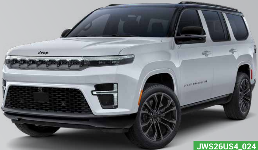
Summit Reserve in Silver Zynith