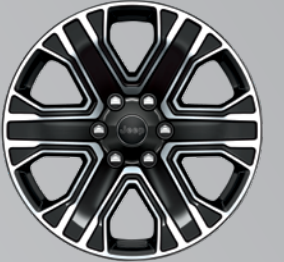
20-inch Machined-Face Aluminum with Gloss Black Pockets (Available; Required Option at Launch)