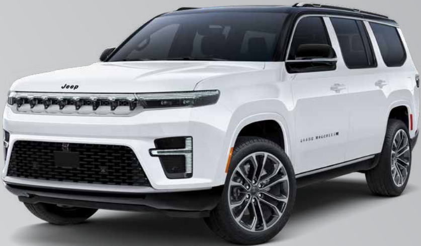
Summit in Bright White