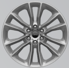
22-inch Painted Satin Carbon Aluminum (Late Availability)