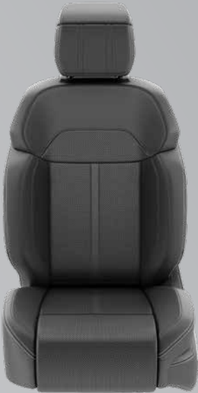
Ventilated Nappa Leather-Trimmed with Axis II Perforations and Global Black / Smoke Dual Accent Stitching — Global Black (Standard)