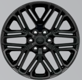
22-inch Painted Gloss Black Aluminum (Standard)