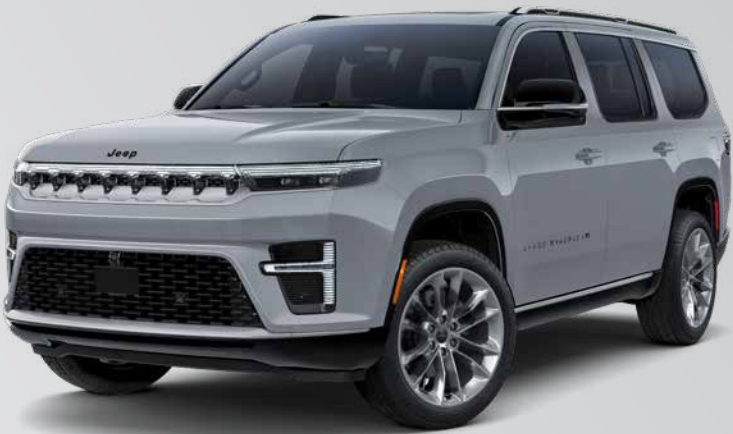
Limited Reserve in Ghost