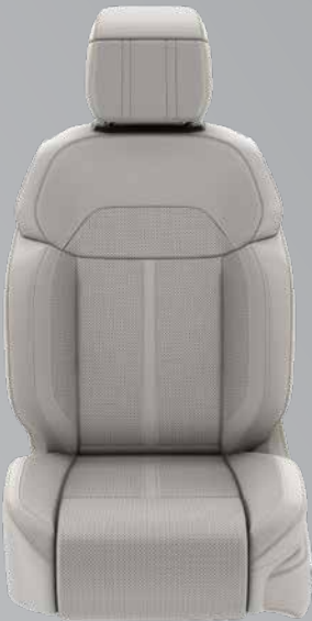
Ventilated Nappa Leather-Trimmed with Axis II Perforations and Sea Salt / Cognac Accent Stitching — Sea Salt / Global Black (Standard)