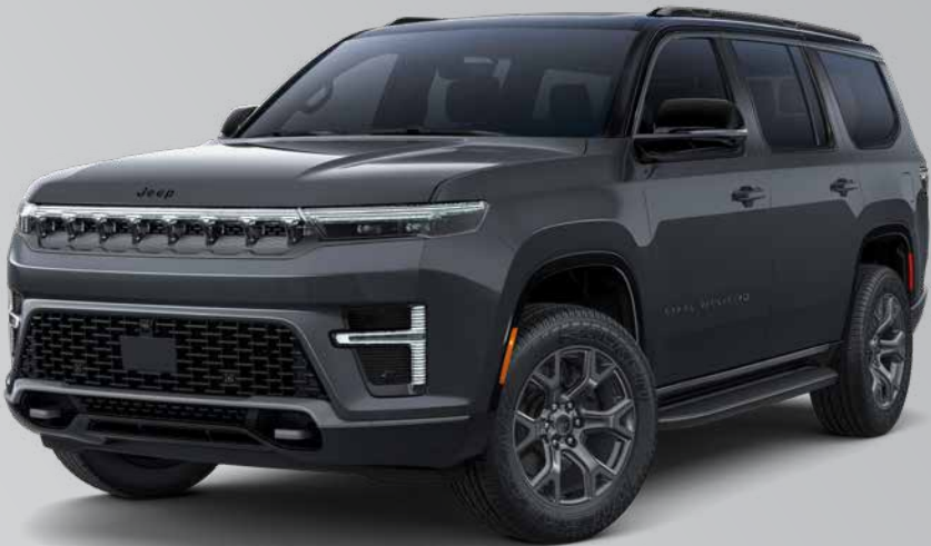
Upland in Baltic Gray Metallic