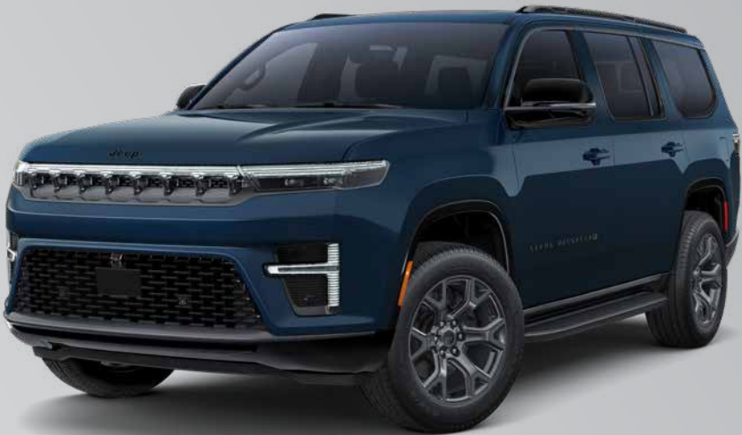
Limited Altitude in Fathom Blue Pearl