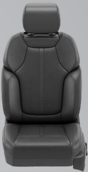
Ventilated Nappa Leather-Trimmed with Axis II Perforations and Global Black / Smoke Accent Stitching — Global Black (Standard)